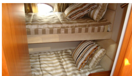
Cabine 2 lits